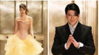
'Project Runway' alum Malan Breton presents his Spring 2025 collection.

By TY SASKINS SEPTEMBER 25, 2024, 8:54AM