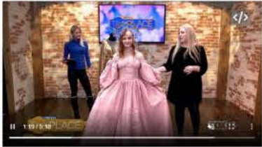
Utah gown designer is off to New York Fashion Week

By: THE PLACE Posted on 2/13/2023 10:06 AM and last updated on 2/13/2023 10:06 AM