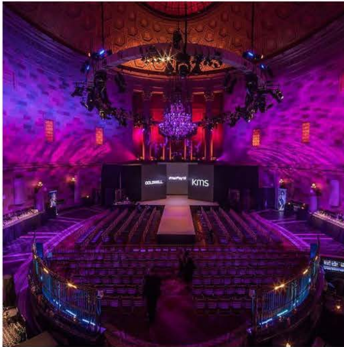
Gotham Hall NYC