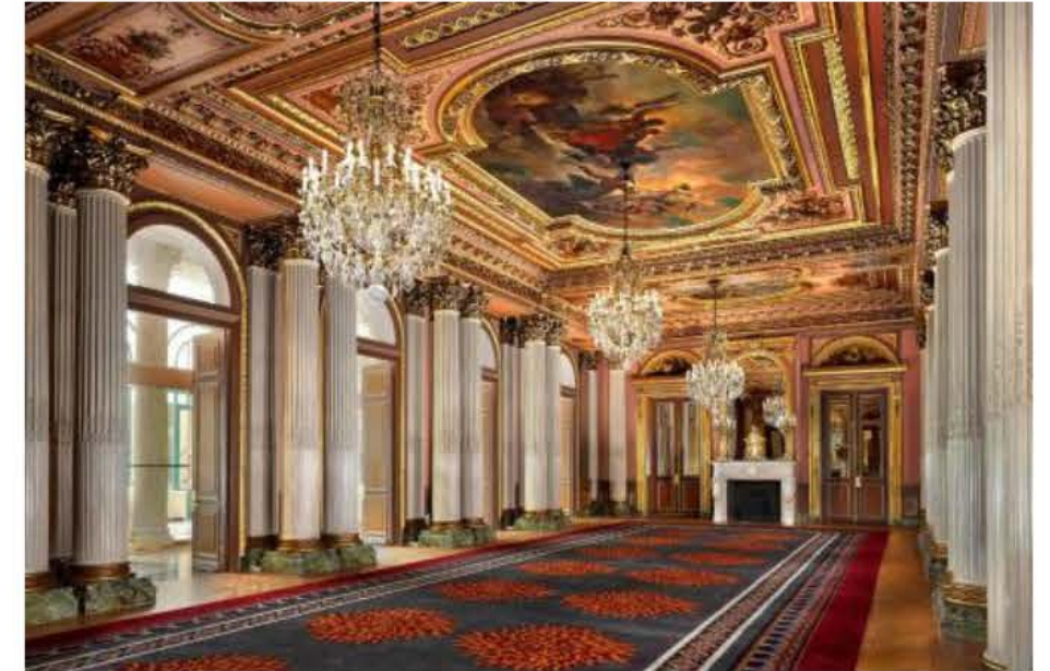
The Westin Paris Vendome