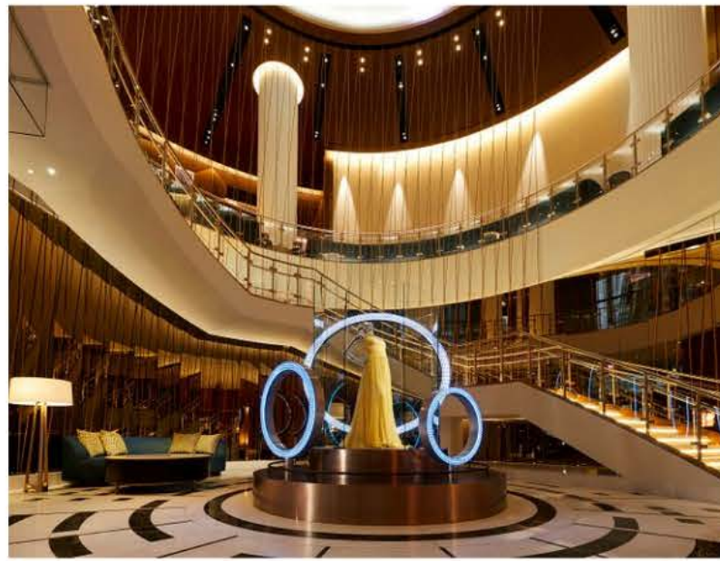
The Hard Rock Hotel NYC