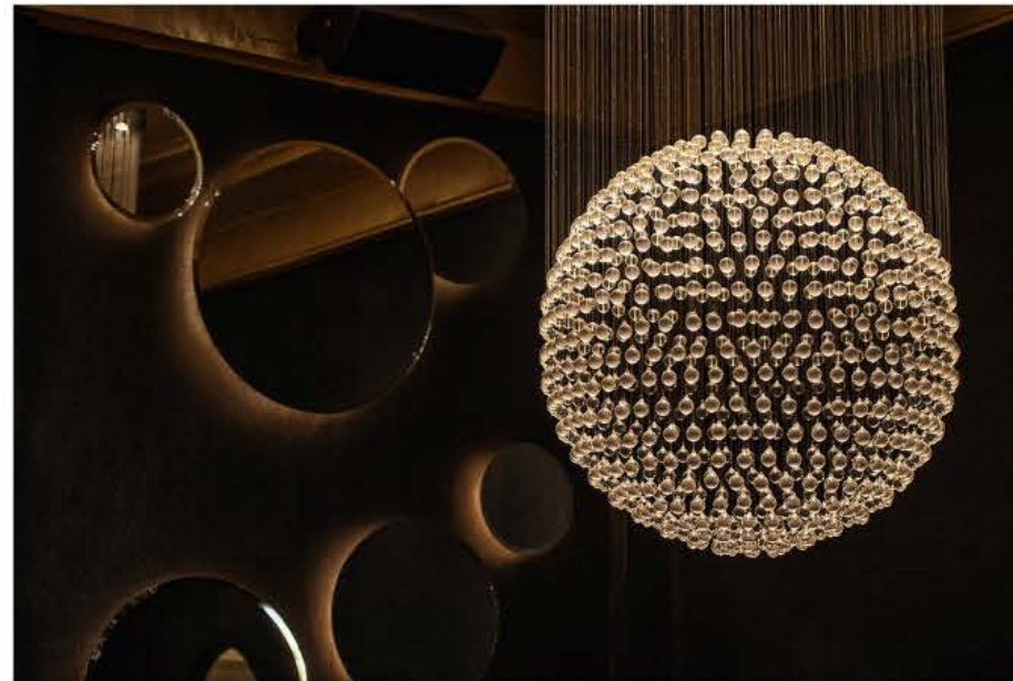
Hotel Edison NYC